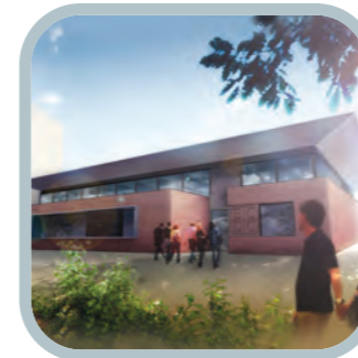
Barmulloch Residents Centre