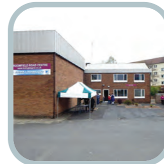
Broomfield Road Centre