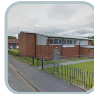
Former Church Hall